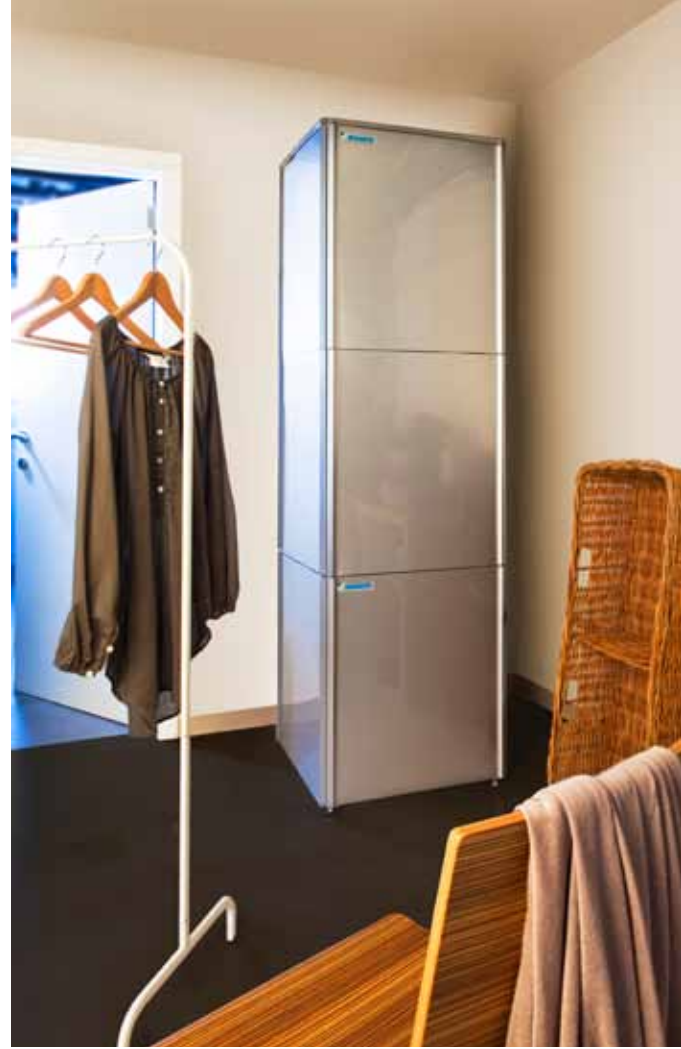
Indoor unit and domestic hot water tank can be stacked

* COP (Coefficient of Performance) of up to 3.08