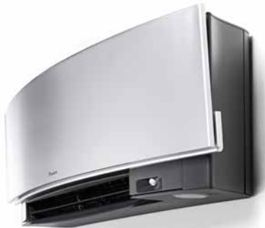
Whisper quiet, down to 19 dB(A)

The two-area intelligent eye sensor controls comfort in two ways. If the room is empty for 20 minutes, it changes the set point to start saving energy. As soon as someone enters the room, it immediately returns to the original setting. The intelligent eye also directs air flow away from people in the room to avoid cold draughts.